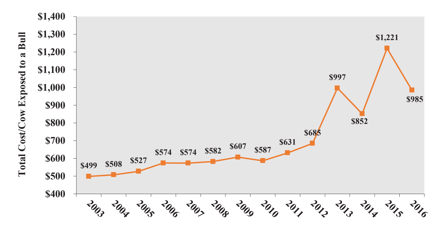
Figure 1. Breakeven cow cost from 2003 through 2016 (SPA)